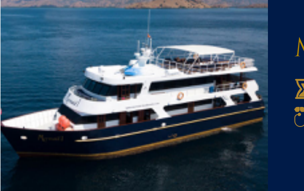
MV Mermaid I